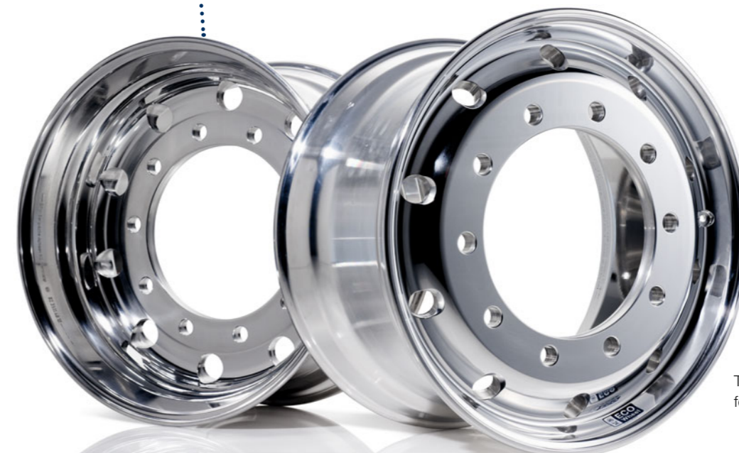
The BPW ECO Wheel: forged for greater economy.