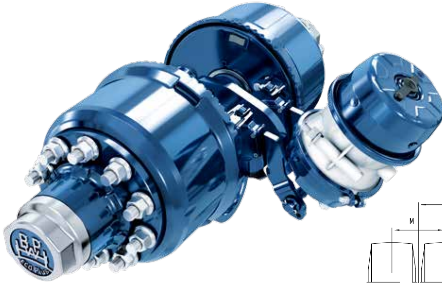
BPW 12 t swing axle with SN3015 brake