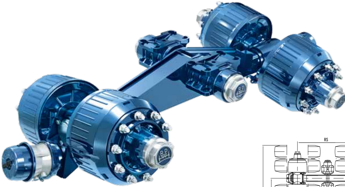
BPW 14 t tandem swing axle with SN4220 brake