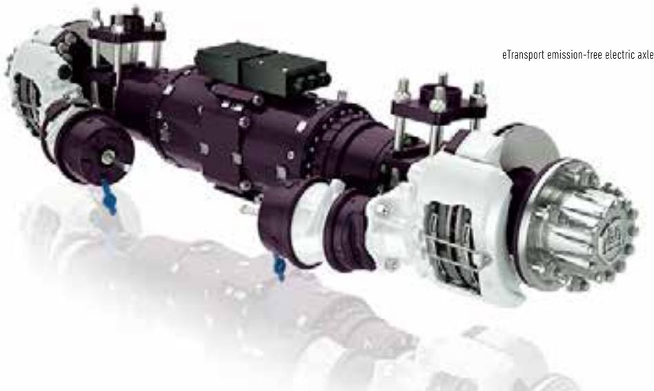
eTransport emission-free electric axle

The benefits for you: We place paramount importance on professional project management. The standardised product development process is an integral part of the BPW organisation and is secured by the VDA maturity model.